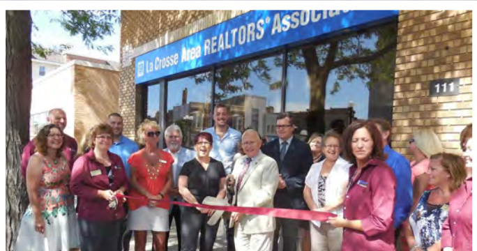
LA CROSSE REALTORS ASSOCIATION