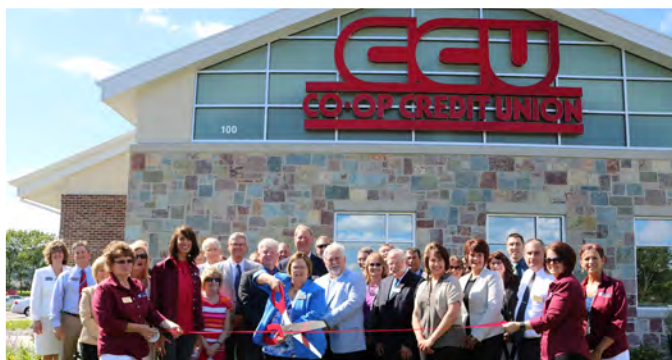
CO-OP CREDIT UNION