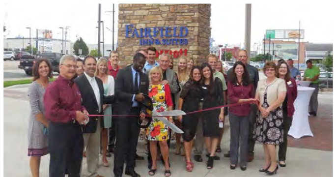
FAIRFIELD INN & SUITES