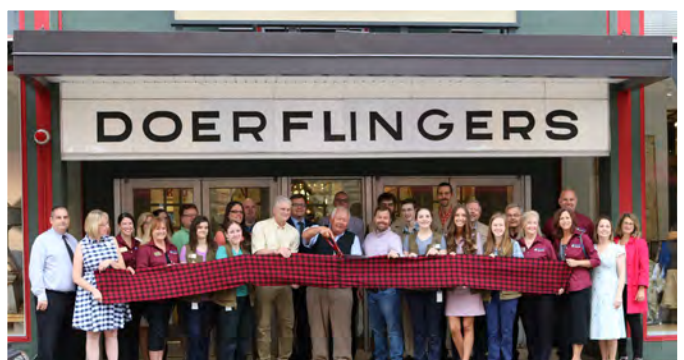
DULUTH TRADING COMPANY