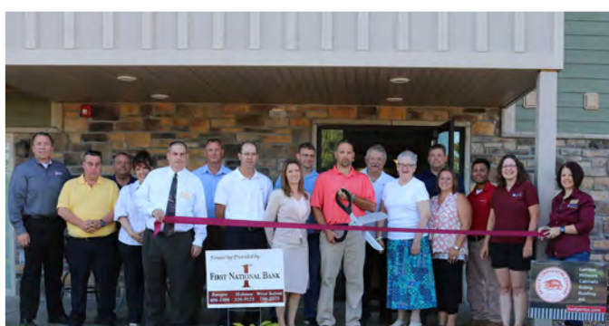
JUSTIN BIRDD PROPERTIES