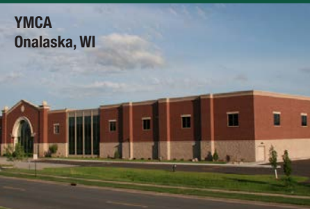
YMCA Onalaska, WI