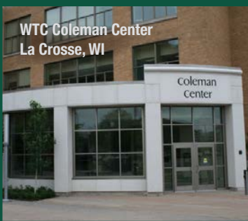
WTC Coleman Center La Crosse, WI