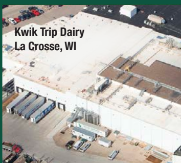
Kwik Trip Dairy La Crosse, WI