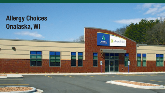
Allergy Choices Onalaska, WI