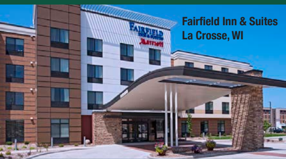
Fairfield Inn & Suites La Crosse, WI