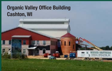
Organic Valley Office Building Cashton, WI